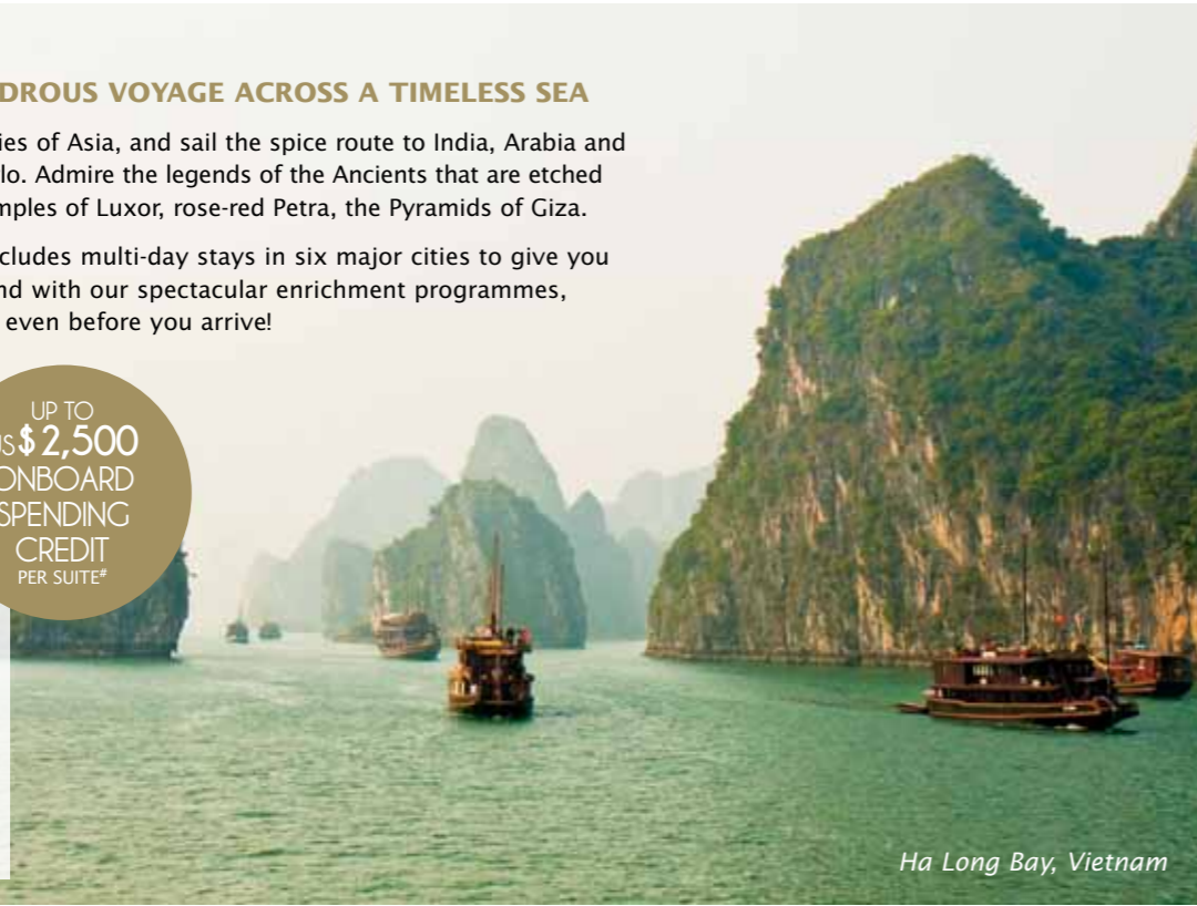
Ha Long Bay, Vietnam