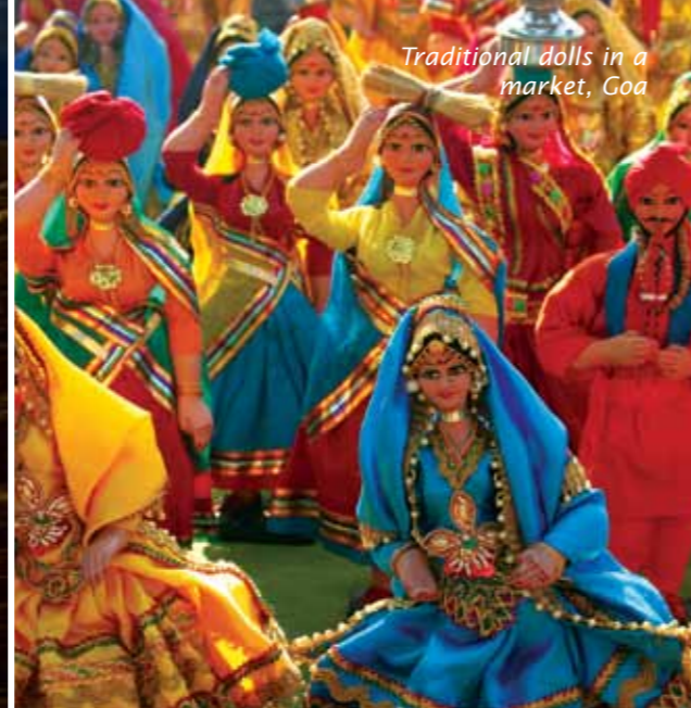
Traditional dolls in a market, Goa